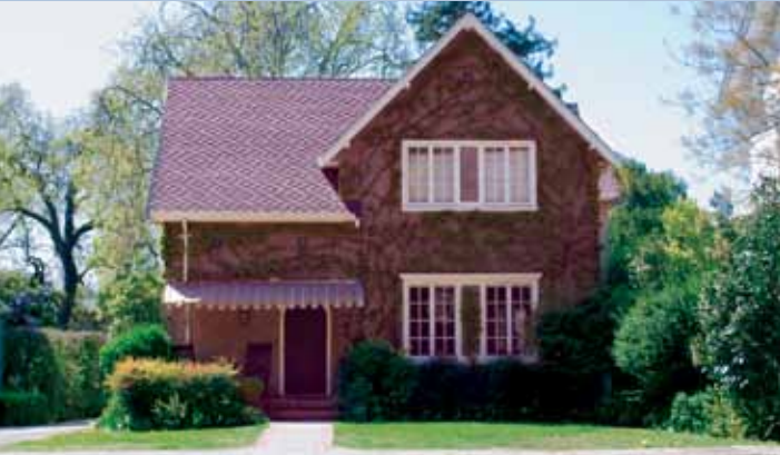
Kline House, 364 2nd Street

The Harkey House was built in 1874. The house is of simple classical design, a Greek Revival with a front gabled roof, bracketed cornices, quoined corners, tall crowned windows and a balustrade porch. Harkey was an early sheriff of Sutter County, who wanted a residence close to the courthouse. It has operated as a bed and breakfast inn since 1983.