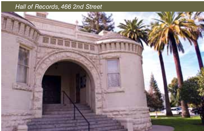
Hall of Records, 466 2nd Street

Sutter County Hall of Records was built in 1891 of brick, concrete, granite, slate and plaster to be as nearly fireproof as possible. In Romanesque Revival style, its squat round towers, arches and heavy masonry firmly anchoring it to the earth suggest a fortress-like security and air of permanence. It was built by the Marysville firm of Swain and Hudson. Now restored, it is host to the Sutter County Board of Supervisors meetings.