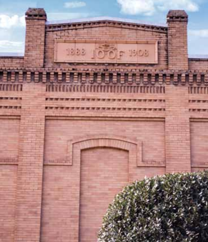
IOOF Building, 532 2nd Street