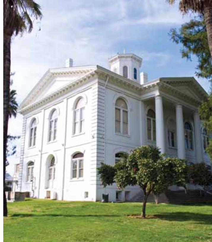
Sutter County Courthouse, 446 2nd Street, Yuba City