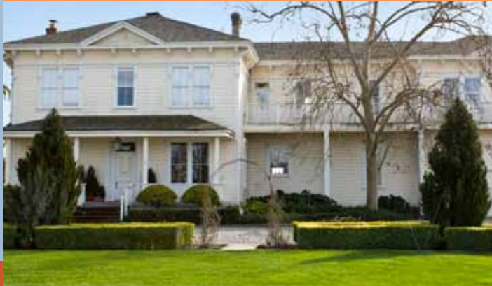
Dahling House, 2600 Lincoln Road