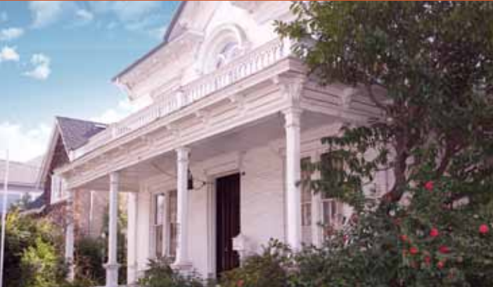
Craddock House, 370 2nd Street Yuba City