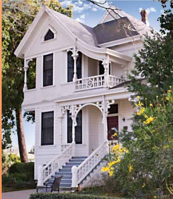
Littlejohn House, 1300 Franklin Avenue, Yuba City