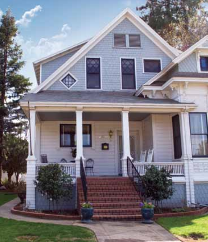
The Green House 240 C Street, Yuba City